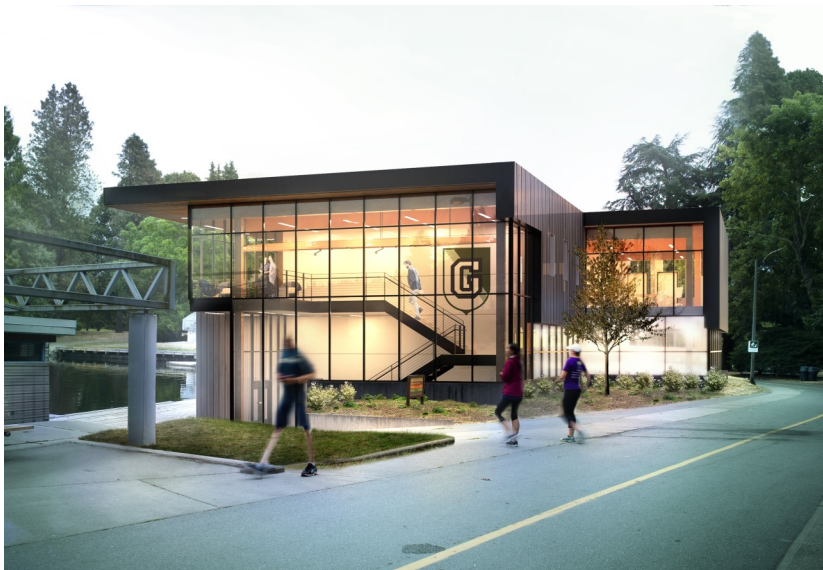
The Proposed Green Lake Community Boathouse