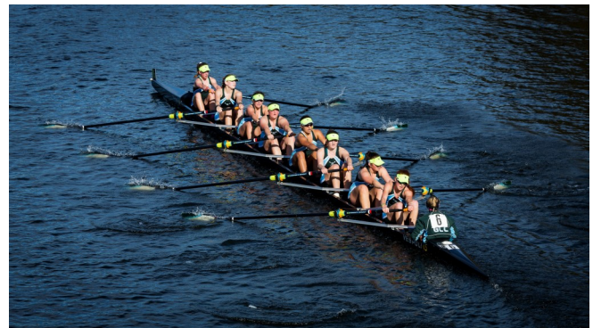
Girls 8+ in Boston

After that our Varsity 8+ and Varsity 4+ headed to Boston. This was our worst trip, and our best trip, all at the same time. On the first morning we arrived a stomach bug hit one of the rowers in the 4+ and quickly spread to other rowers. The rest of the weekend seemed to be a scramble to care for the ill and also keep the healthy athletes in top shape. We had some success, but in the end not everyone was feeling 100 percent and our alternate had to switch sides and jump into the 4+ on race day. What made it the best trip, however, is that this group of racers never made an excuse, never panicked, and fully embraced the "any boat, any seat, any time" ethic of Green Lake. In fact, not a single one of the unfortunate kids who fell sick even uttered a complaint, even when losing their cookies. In the end they raced well and posted solid results (12 th in the 8+, 31 st in the 4+), and guaranteed entries for next year. No one could have done better or asked for more.